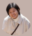
Yan Jing Youth Arm Leader